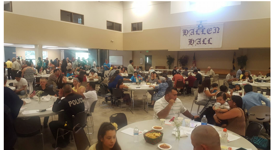
Third Thurston County Trust Building Potluck, 2018