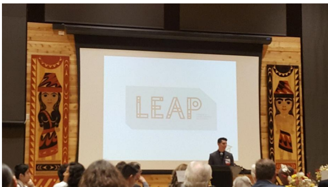
Latino Educational Achievement Project