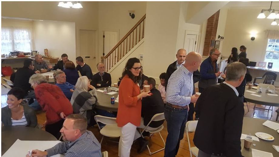
First Thurston County Trust Building Potluck, 2016