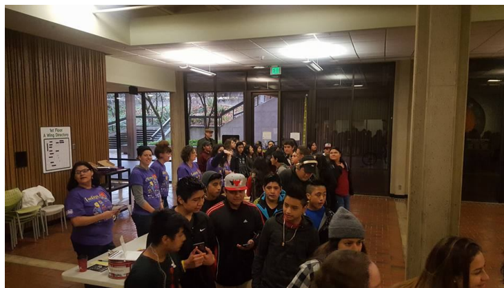
Latinx Youth Summit 2017 At The Evergreen State College w/ Las Cafeteras