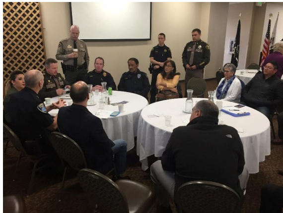
Mason County Sheriff's Breakfast

Washington State Coalition for Language Access